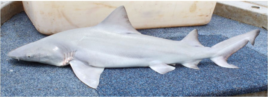
Figure 1. Northern River Shark ( Glyphis garricki ), South Alligator River, Northern Territory. (Peter M. Kyne)

The river sharks (family Carcharhinidae; genus Glyphis ) are euryhaline sharks found in the tropical Eastern Indian-Western Pacific region. All five described species are threatened with extinction with restricted ranges and small population sizes, and their ecology is generally poorly-known. The Northern River Shark ( Glyphis garricki ) (Figure 1) is found in northern Australia with three known population centres: (1) river drainages of the Van Diemen Gulf, Northern Territory; (2) King Sound, Western Australia; and (3) Joseph Bonaparte Gulf/Cambridge Gulf and associated rivers, Western Australia (Pillans et al. 2010). Additionally, the species has been recorded from southern Papua New Guinea (Compagno et al. 2008), but there is little information on its distribution and occurrence there.