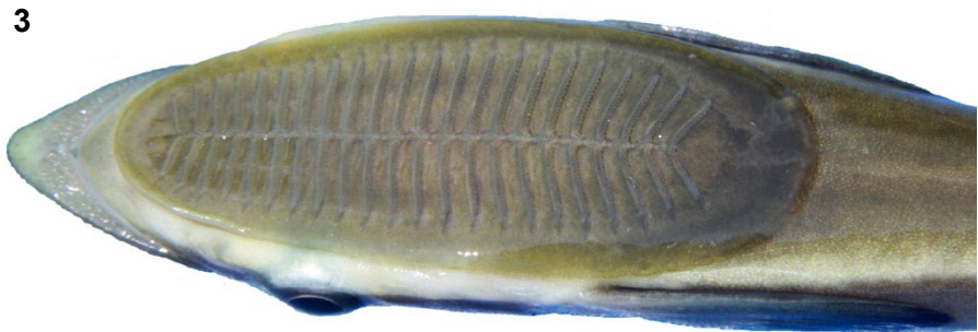
Figure 2. Sharksucker ( Echeneis naucrates) collected from a Northern River Shark ( Glyphis garricki) host in the West Alligator River, Kakadu National Park, Northern Territory.