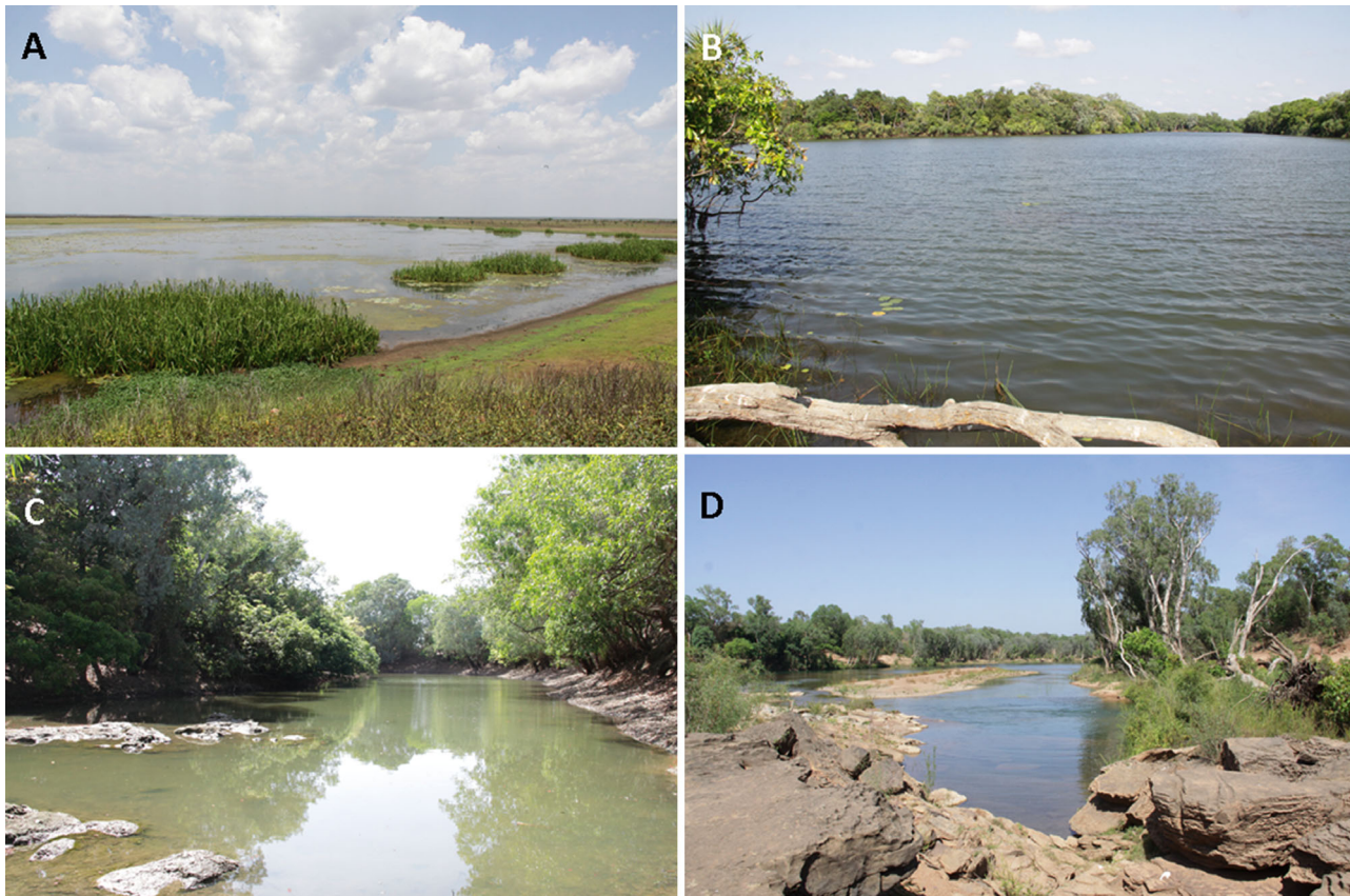
Fig. 2. Examples of Daly River floodplain waterholes and main-channel river sites (see Fig. 1) tested for the presence of large-tooth sawfish Pristis pristis using eDNA. (A) Milkwood Lagoon, a shallow floodplain waterhole; (B) Mission Hole, a deep floodplain waterhole; (C) Kilfoyle Lagoons, a series of disconnected pools; and (D) Beeboom Crossing, a natural rock bar and artificial road crossing on the main-channel

ples were collected at each site, along with 1 negative control containing bleach-treated tap water, which was subjected to the same treatment as the sampling containers (i.e. a sealed container affixed to a pole and submerged into the water body). Water samples were cooled and stored on ice until filtering.